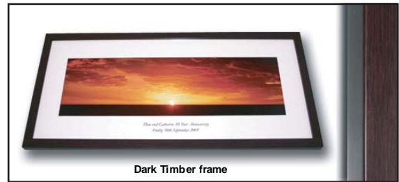
Dark Timber frame