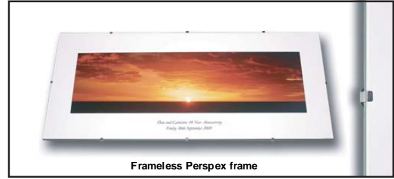
Frameless Perspex frame