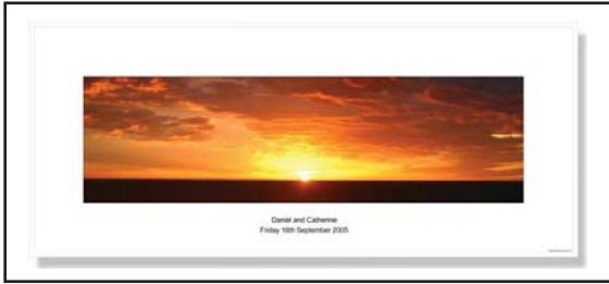
Print only $60